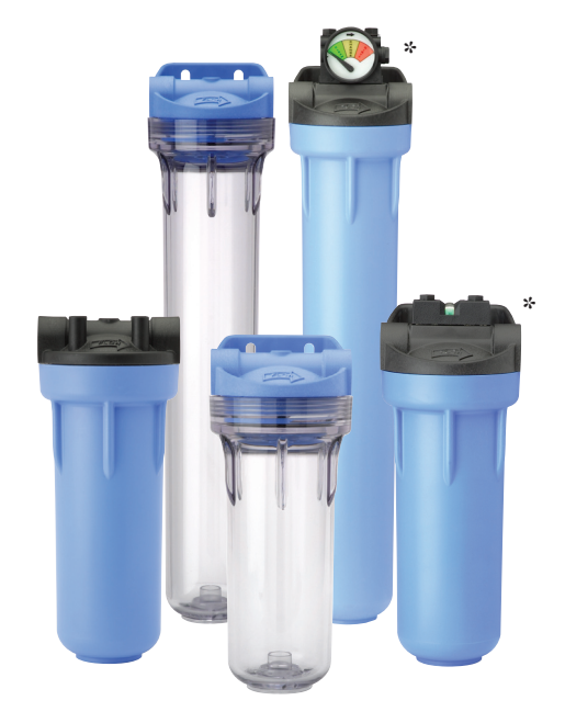
* Shown with differential gauge. Gauges sold seperately.